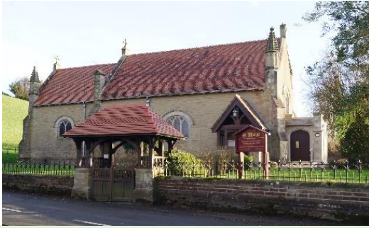
A 'Chapel of Ease' in the Parish of Warton, providing a place of worship for the villagers of Borwick and Priest Hutton.

St Mary's has launched a campaign to raise £2500 to upgrade the current lighting to a more eco-friendly system which will be more efficient and less expensive to run. You will hear more about this in the weeks and months to come. Please help if you can!